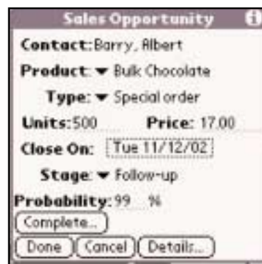
Manage your pipeline with easy to use tracking tools.